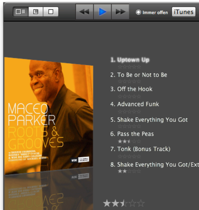
Track & Album rating in the perspective appearance